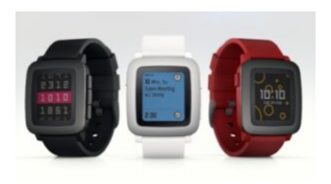
Pebble Time Tips The Pebble Time Smartwatch